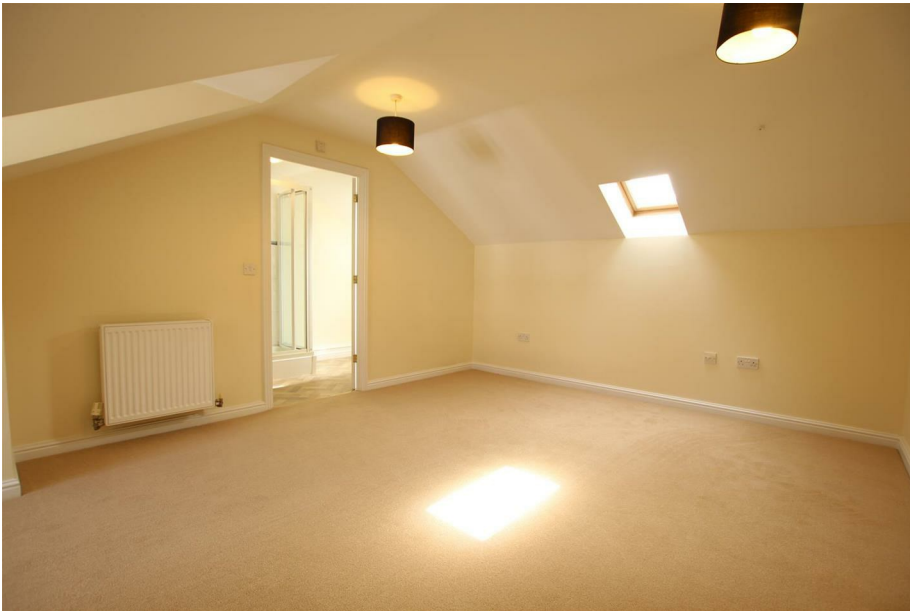
Bedroom One 16'4" x 12'2" restricted head height (5 x 3.732 restricted head height )