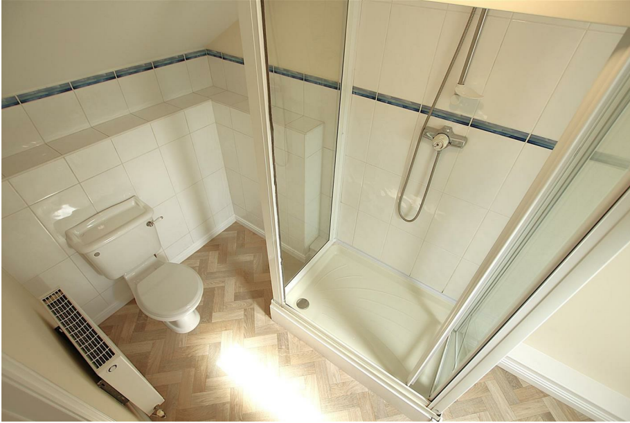
En-suite 9'10",3116'9" x 5'7" (3,950 x 1.726 )